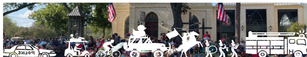
$10 PARKING ON DAY OF EVENT - LOT OPEN AT 7:30 AM - BRING YOUR OWN LAWN CHAIRS