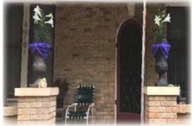
Easter Flowers before they were placed in the church by Women's Ministries.